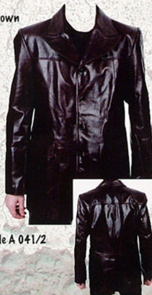
Style A 041/2