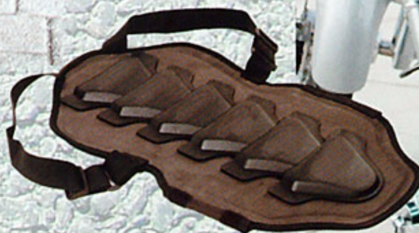
Style AC03 Armadillo Back Protector Articulated spine / lumbar strap-on protection.